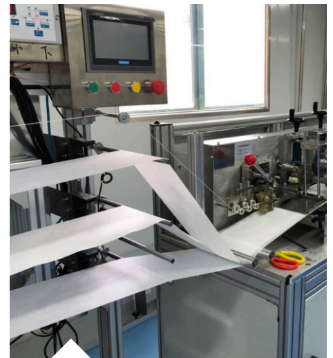
A mask-making machine that uses Inovance's automation system